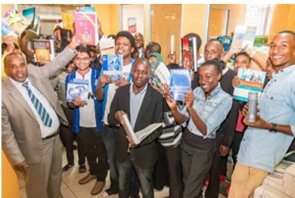
The above photo is from University Dar es Salaam Business School, after receiving a shipment from Ivey. The below photo is from Riara University, after receiving their shipment from the University of Queensland.

For the 39 Country Initiative to continue growing the program, they plan to continue to register faculty in the eligible countries; encourage other schools to collect materials for shipments; explore new partnerships with universities; raise funds for the region-specific book series and professor-to-professor case teaching workshops; and encourage faculty visiting the eligible countries to hold case teaching workshops. If you would like to contribute, consider one of the options listed on their website .